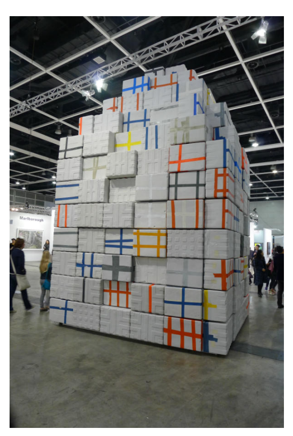
Joao Vasco Paiva "Mausoleum" 341 x 341 x 559 cm is hoping to sell to for HK$1 million ($141,633).

Dominique Lévy Gallery's director Lock Kresler said the fair was a bit of a slow burner for them although they had already sold a few works by <u>Kazuo Shiraga</u>, <u>Zao Wou-Ki</u>, and <u>Yayoi Kusama</u> (prices undisclosed). But their standout work is <u>Pierre Soulages'</u> "Peinture" (1957) for which they have had several serious enquiries by Asian and Australian collectors. (See also: <u>The Big TEFAF 2015 Sales Report –We Have The Numbers On What Sold</u>).