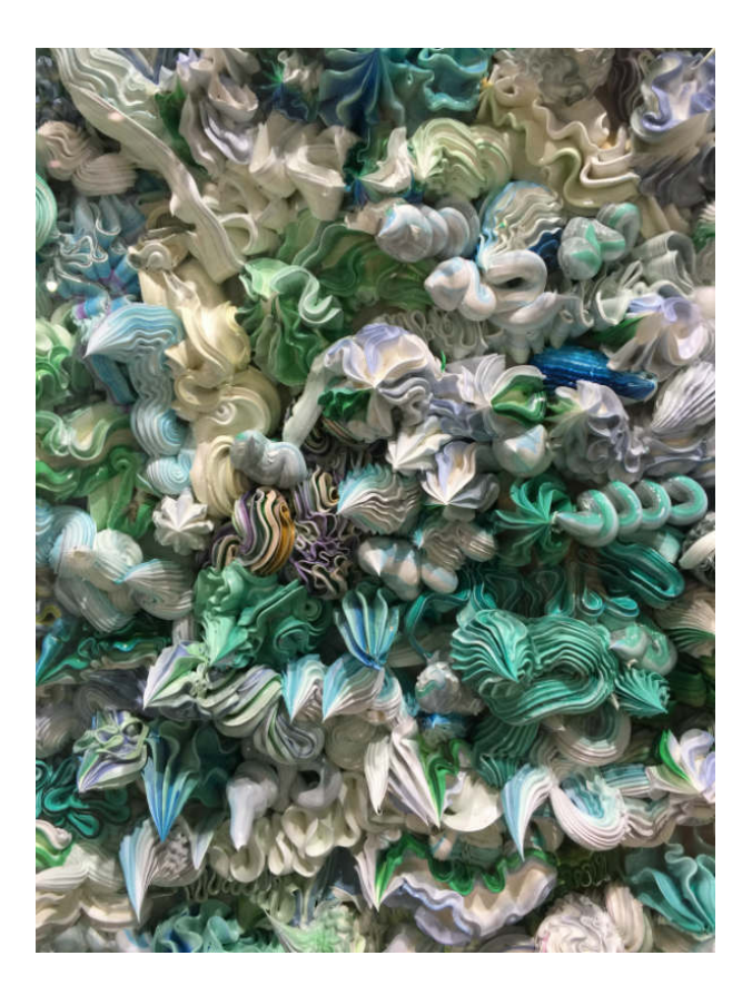
Detail from Xu Zhen's "Under Heaven – 1807NU0138" (2013) which sold for RMB 1.1 Million ($175,796) at Long March Space.

Deals made so efficiently suggest a lot of pre-sale efforts, but dealers say the fair itself, the space, the moment, remains the "real impetus" for sales.