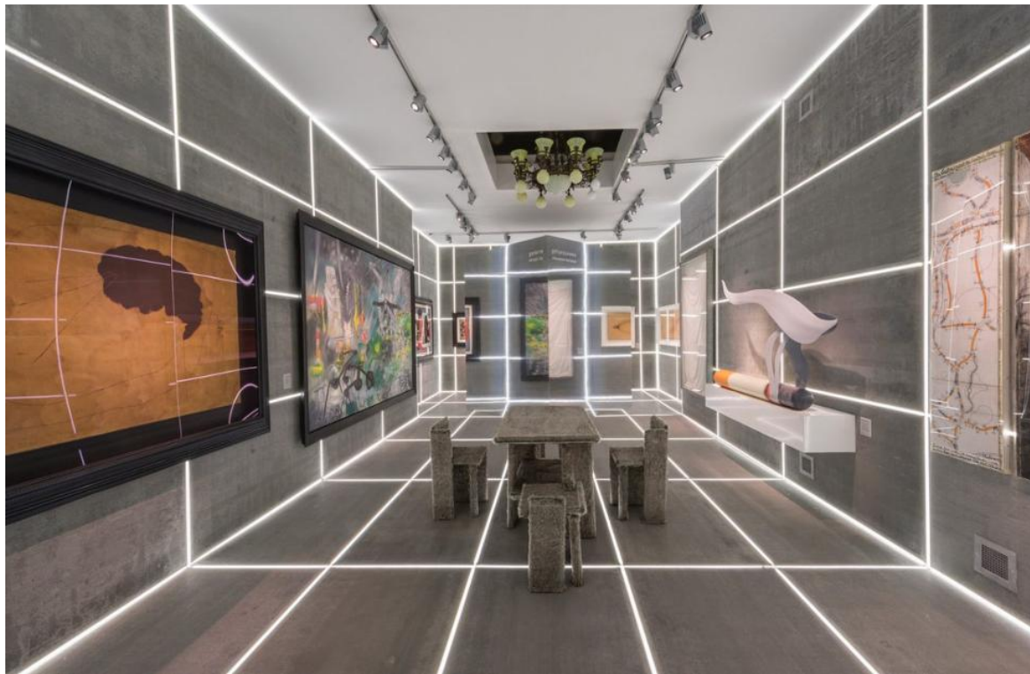
Futuristic Booth Design by Bureau Betak for Galerie Gmurzynska at TEFAF New York

For the first time, TEFAF New York Spring opened their doors at the historic Park Avenue Armory in Manhattan. The inauguration was celebrated with a splendid VIP Opening on Wednesday, attracting the world's art elite. The fair that runs through Monday, May 8th, 2017 exhibits renowned modern and contemporary art and hosts the world's top galleries.