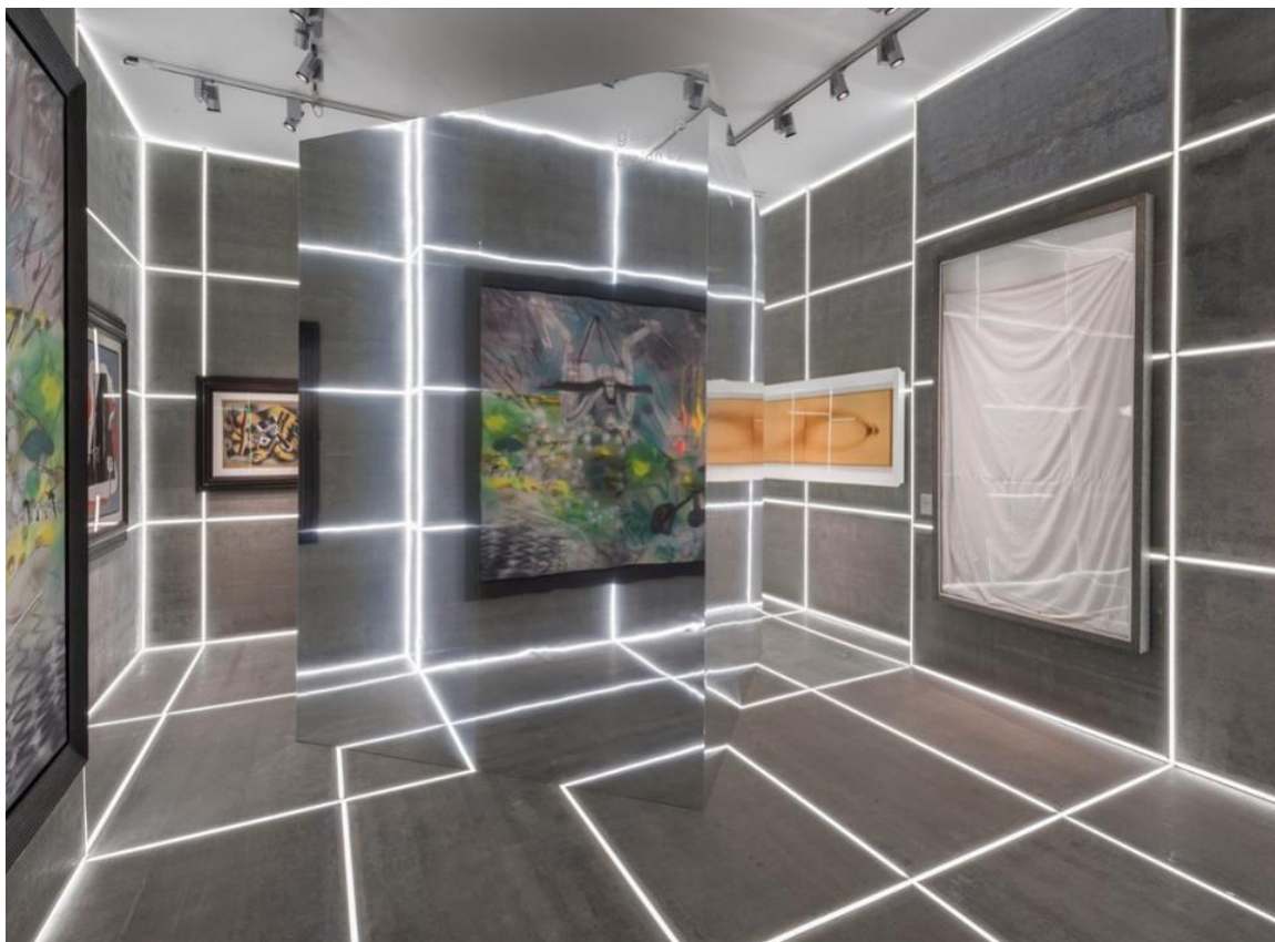
Modern Art meets Futuristic Design. Galerie Gmurzynska meets Bureau Betak.