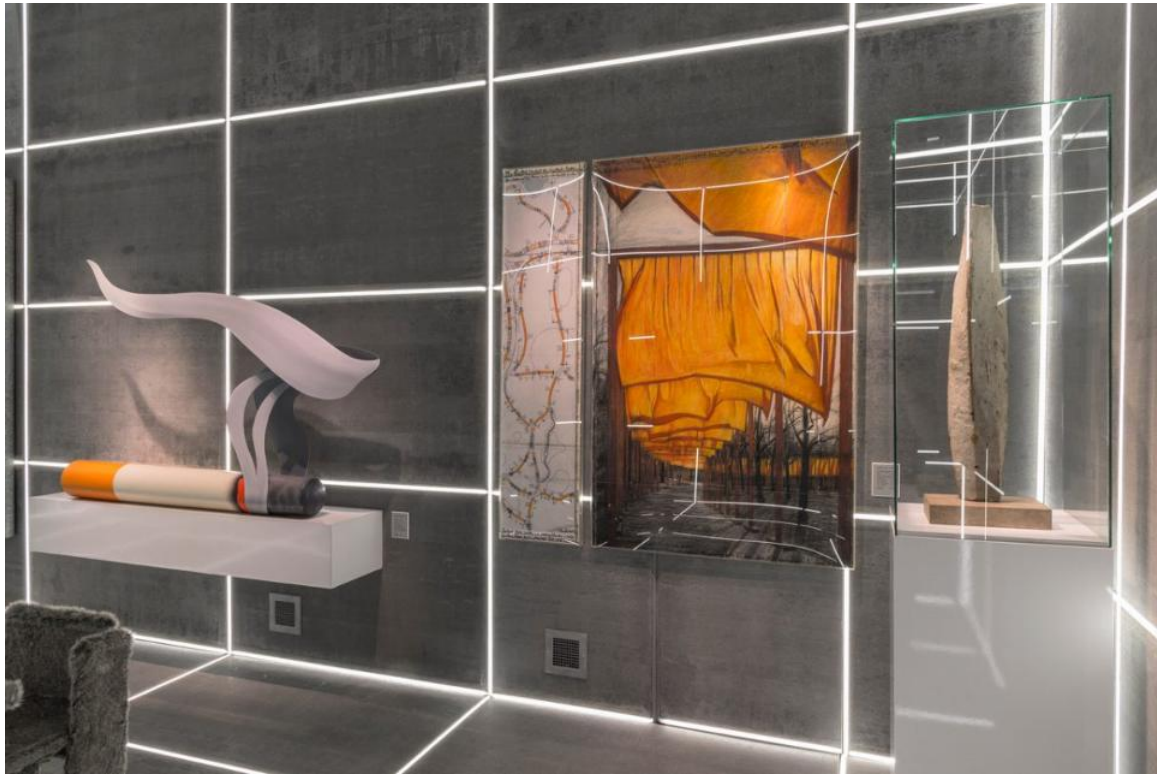
Futuristic Design meets Modern Art at TEFAF New York Spring