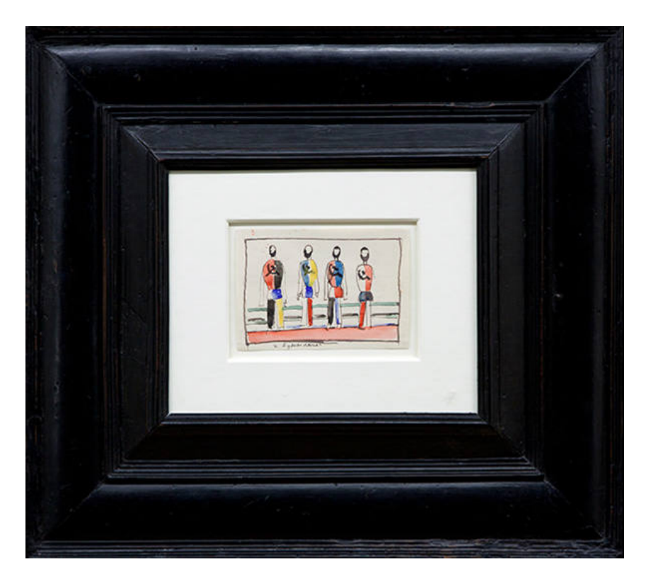
Kazimir Malevich's 'Men of the Future (Nakov PS -48 Aveniriens)' (c1932)

are on private loan, others owned by the gallery and not all are for sale — with eight sculptures and seven pieces of furniture by Judd (some loaned by the Judd Foundation, some privately, not all for sale), it illustrates superbly why Judd found Malevich inspirational. Meanwhile, the catalogue, with texts by Judd and an essay by Evgenia Petrova, deputy director of the State Russian Museum, adds critical heft.