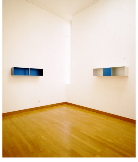
Donald Judd, Untitled , 1991. Donald Judd © Judd Foundation.