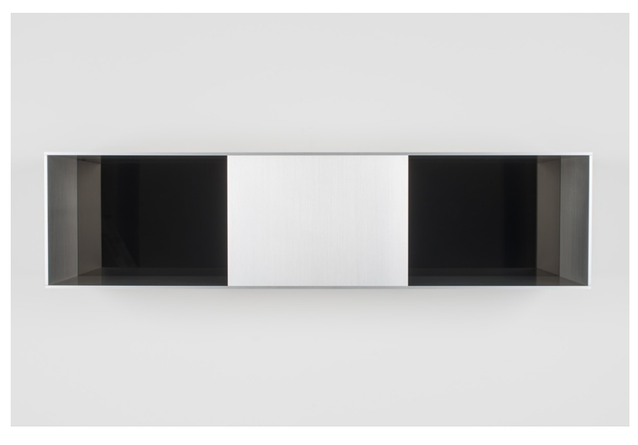
Donald Judd, Untitled , 1991. Donald Judd © Judd Foundation. Courtesy of Galerie Gmurzynska.

And, for the first time, the show includes samples of Judd's furniture. "It is a little hint to the diversity of Don's work, since we can't bring all of Marfa into Galerie Gmurzynska," says Flavin.