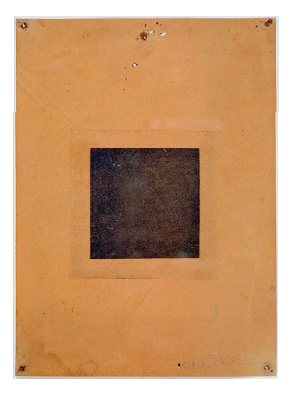
Kazimir Malevich, Black Square , 1915.

Although these two artists focus on geometric shapes, particularly the square—two-dimensional in Malevich's work, three-dimensional in Judd's —Flavin sees a deeper connection.