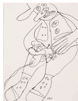
Jean Dubuffet, Pisseur à gauche III , 1961