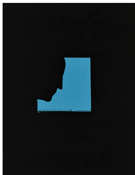
Marcel Duchamp, Poster after "Self Portrait in Profile," 1959

galerie gmurzynska 20th century masters since 1965 www.gmurzynska.com