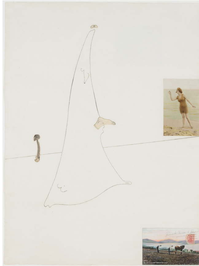
Joan Miró, Untitled (Drawing-Collage) , 1933

Saturday, September 1st, 2018, 5 pm – 12 am Vorstadt 14, 6300 Zug, Switzerland