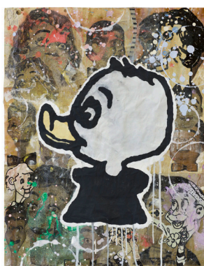
Donald Baechler, Huey (Duck) , 2011