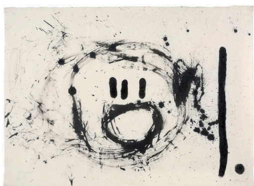
Joan Miró, Untitled I , January 13, 1967